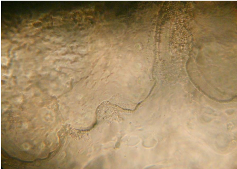
Figure 3. Sample image obtained using an optical microscope after removal the external exposure.